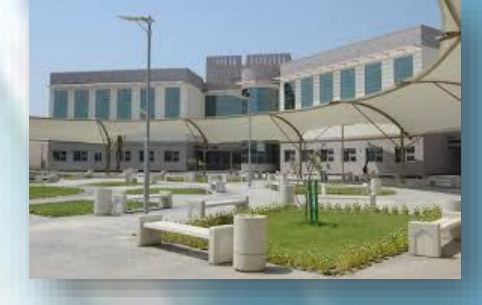
Many schools Tiles & Marble work